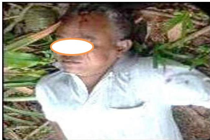
Deputy Staff Officer died in the aftermath of killing of PDFs

PDF Terrorists Abduct Teachers Including the Principal of State Agricultural Institute–Dawei and also Kill a Deputy Staff Officer of the Township Agricultural Department