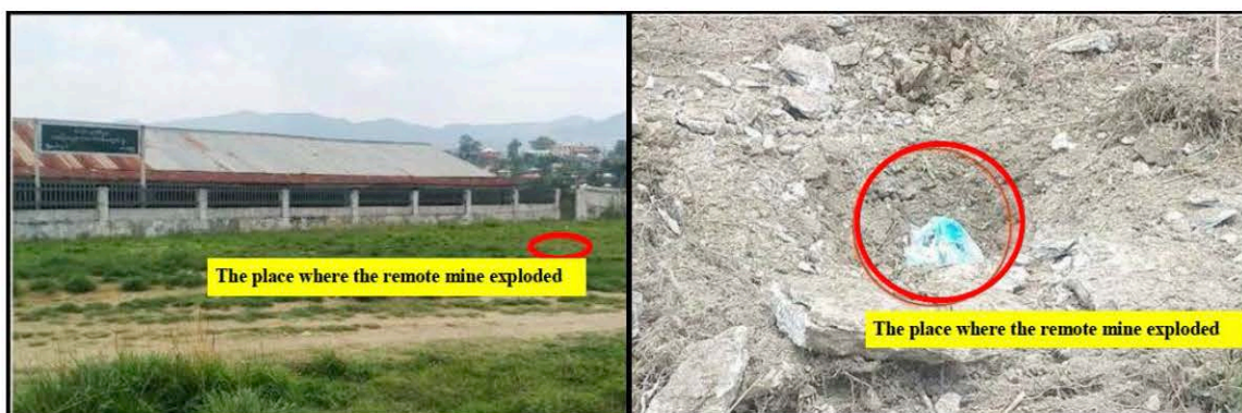
Launching two remote mines attack on the area near Basic Education Sub-High School (Myoma) in Tedim by PDF terrorists

On 2 June, PDF terrorists, subordinates of CRPH and NUG terrorist groups, made an attack of two remote mines at the entrance to the Basic Education Sub-High School (Myoma) in Tedim in order to strike terror into the students who are learning peacefully.