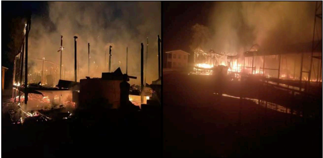
Arson attacks on No (1) Basic Education High School in Pekon Township by KNPP/PDFs

On 3 June, PDF terrorists committed arson attack on No 1 Basic Education High School in Nyaunggon ward (5) of Pekon Township in Shan State (south). Therefore, a single-storey building in the school campus was burned to the ground.